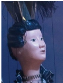
Queen of the Night