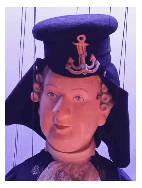
Captain Daland, Senta's father